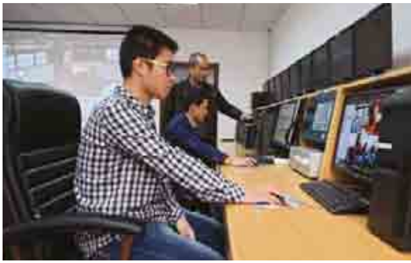
SNIMI's ECDIS Simulators are used as a training tool for familiarisation and specific operational training