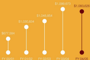
Profit Before Tax ($S)