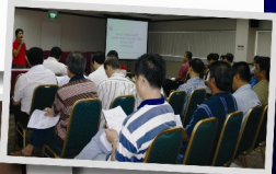
An NTUC Officer giving a presentation on SEP.

Participants paying rapt attention during the SEP briefing.