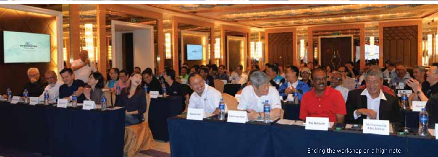
Ending the workshop on a high note.