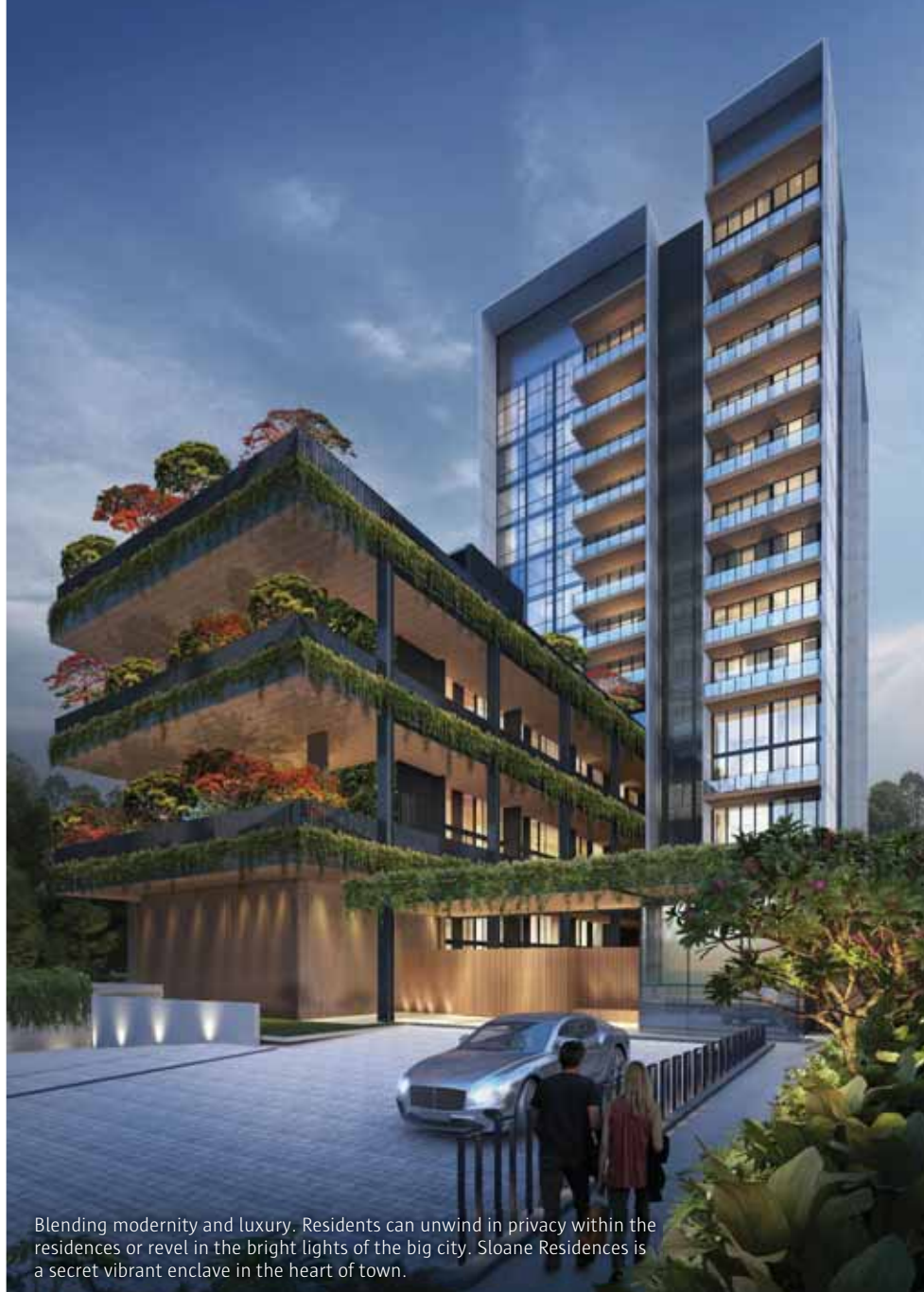
Blending modernity and luxury. Residents can unwind in privacy within the residences or revel in the bright lights of the big city. Sloane Residences is a secret vibrant enclave in the heart of town.

Reaching 12 storeys, Sloane Residences contains 52 unique apartments, each intricately designed and crafted. From the opulent imported finishes and materials to the premium selection of Valcucine (Italy) kitchen cabinet, V-Zug kitchen appliances,