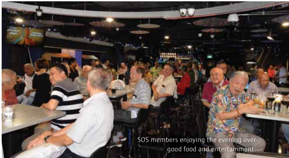
SOS members enjoying the evening over good food and entertainment.