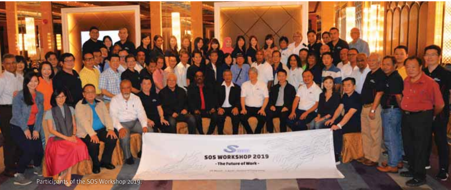
Participants of the SOS Workshop 2019.