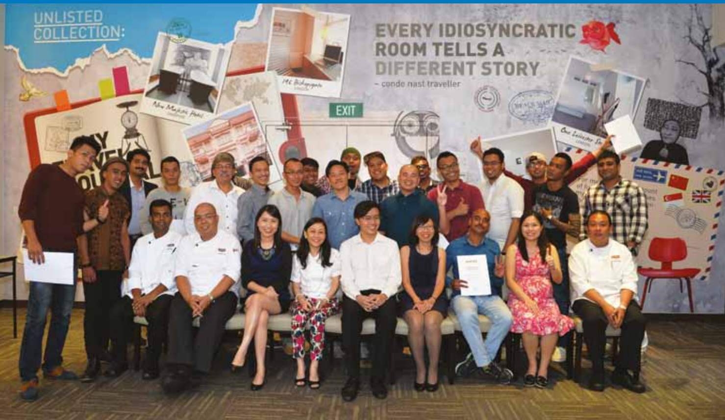
The trainees celebrating in a graduation ceremony at SHATEC, together with the trainers and course coordinators from SOS, SHATEC and e2i

All 19 trainees from the Seafaring Cook Place-and-Train Programme have completed Phase 1 of the programme in August, after three months of intensive training at the Singapore Maritime Academy, Singapore Hotel and Tourism Education Centre (SHATEC) and Seacare Thrift.