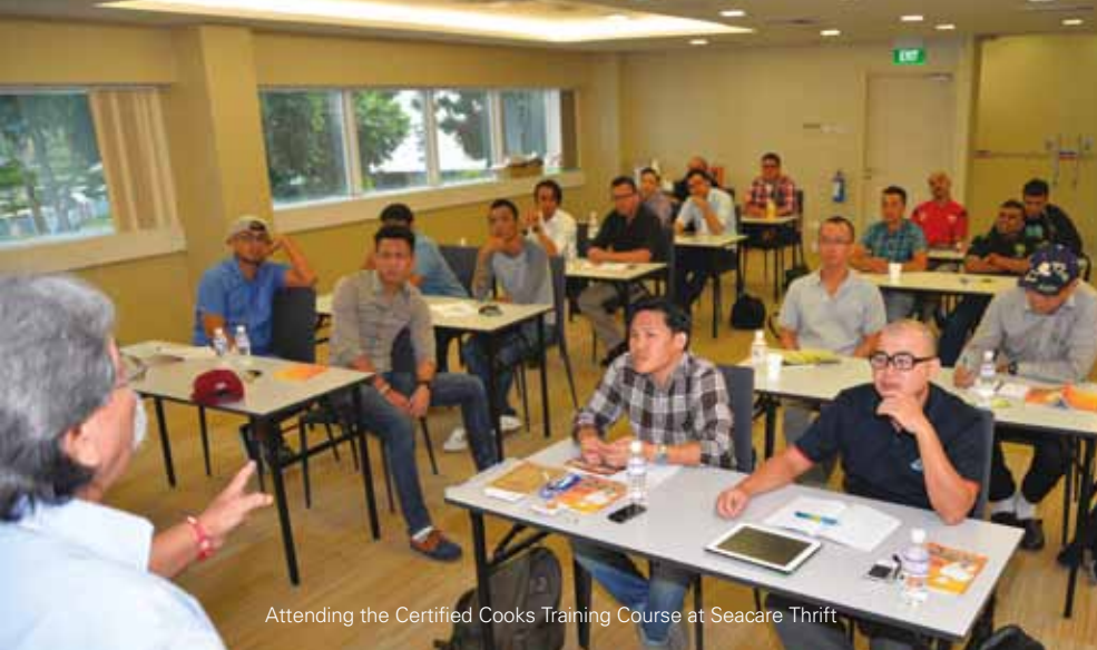
Attending the Certified Cooks Training Course at Seacare Thrift