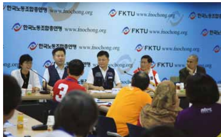
Officials from Federation of Korean Trade Unions (FKTU) sharing their experiences with the Singaporean delegates during their learning visit